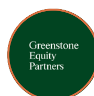
Greenstone Equity Partners