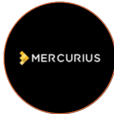
Mercurius Advisory Services