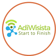
PT Adiwisista Financial Teknologi