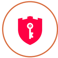
Crypto Family Office