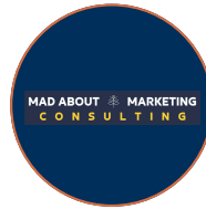
Mad About Marketing Consulting