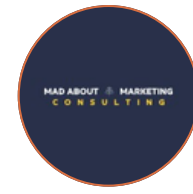
Mad About Marketing Consulting