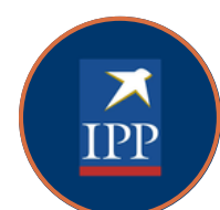
IPP Financial Advisers Pte Ltd